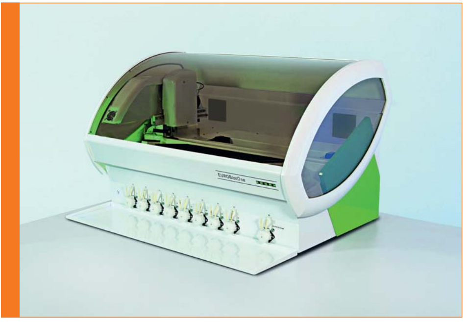
antibodies against up to 54 allergens in parallel. The system encompasses over 400 different allergens and allergen components, which are combined into indication-oriented, country-specific or region-specific profiles. Indication areas encompass inhalation, food, atopy, insect venoms, cross reactions and pediatric allergies. All profiles include an integrated CCD (cross-reactive carbohydrate determinant), unique to this system, to aid the interpretation of cross reactions.

The DPA-Dx profiles described here are part of the established EUROLINE allergy system, which provides efficient multiparameter analysis of IgE